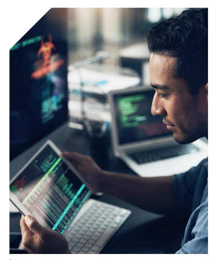
<sup>1</sup> Source: <u>Palo Alto Networks, The Connected Enterprise: IoT Security Report 2021</u>

Often, industrial IoT devices have long product lifecycles, which provides cyberattackers with more time to research and learn the embedded systems' vulnerabilities before the devices reach their end of life. Additionally, these devices are commonly deployed in remote locations outside of traditional IT networks and security tools, and many systems are battery powered and not always connected. This makes IoT devices more difficult to monitor and update, and more vulnerable to unauthorized access and cyberattacks.